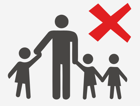
1 adult with 3 children: 1 aged under 4 years, 2 aged 4 - 7 years

Supervising adult must be at least 16 years of age and remain in the same pool as the child/ren. Supervising adult must ensure all non-swimmers wear approved swimming aids at all times.